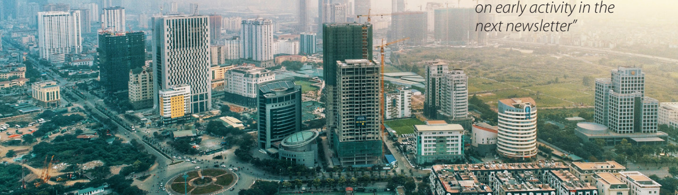
Aerial view of Hanoi - Vietnam

"We wish our new sales team all the best and will give an update on early activity in the